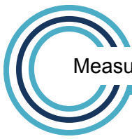
Table 3: Measures of Success and Strategic Transportation Goals