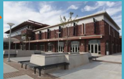
New College Institute

Development: The New College Institute, built a 52,000 square foot facility on the Baldwin Block in 2014, creating an education and technology hub. A block away, a developer is converting an empty hotel into a mixed use development.